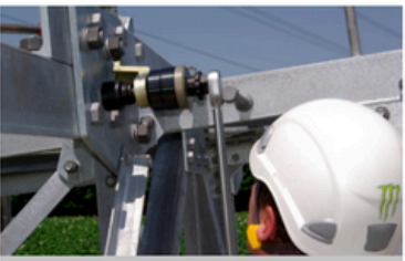
alkitronic® M-HG operating on electricity pylons. Accurate tightening via torque wrench.